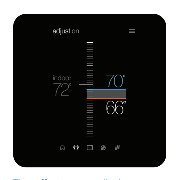
The adjust screen displays the current temperature on the left and set-points on the right. Change the set-points by dragging them or by turning the dial.