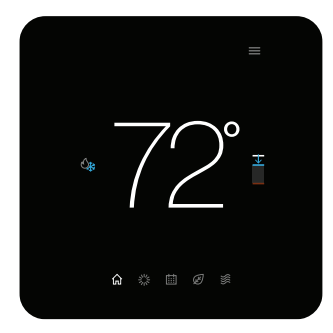
The home screen displays the current temperature, the current system mode, and icons leading to each of the top level screens.